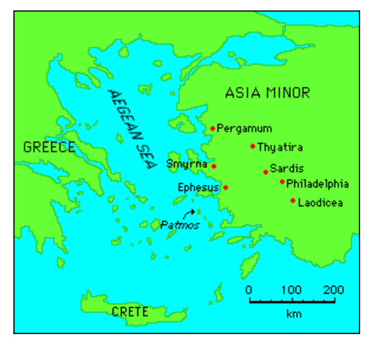
Patmos and the seven churches of Asia Minor